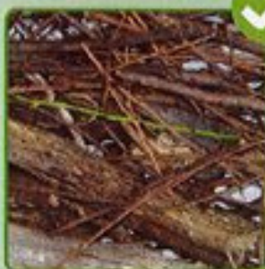
Small sticks & twigs