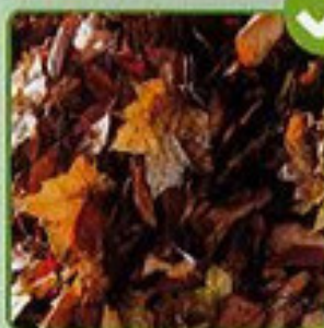
Dry leaves & prunings