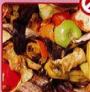
Food waste & garbage