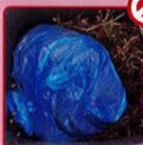
Plastic bags & liners