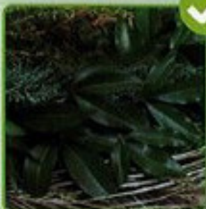
Fresh leaves & prunings