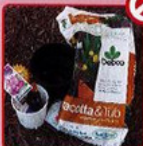
Potting mix bags & pots

Your recovered garden organic waste is processed into high quality mulch products. Putting the right items in counts! For further information or questions, give us a call on 02 6740 2100